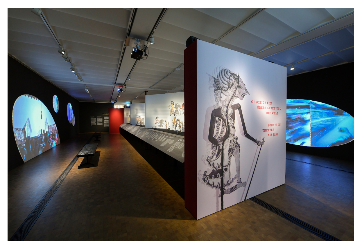
Figure 3 View of the exhibition space with video projections, designed by Martin Sollberger and Noémie Jeunet.

Kulit, but the faces of the figures were intentionally shaped like Arabic letters (Jatmika 2017, 10). Whether the identification of the puppets facial features with Arabic letters is correct or not, this kind of argumentation reveals how successful and inclusive the appropriation of Wayang Kulit by Javanese scholars, activists, politicians, and artists has been. Its content and values are seen as being in line with Islamic teaching.