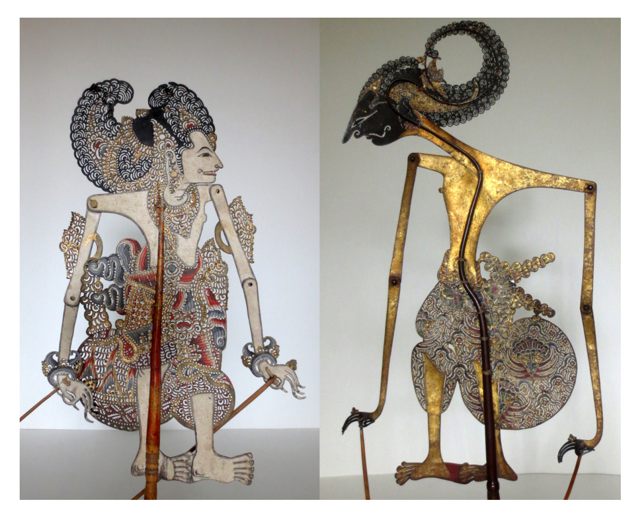
Figure 2 Balinese shadow puppets (left) resemble the form of the human body, while Javanese shadow puppets (right) have unnatural body proportions due to an intentional stylisation. A comparison of the neck and shoulder areas, facial features, and waists makes the differences quite obvious. Left : Arjuna (detail), Bali, 19th century, 41 x 18.5 cm, Museum Rietberg, acc. no. RIN 209, Gift of M. Schmid. Right : Arjuna (detail), Central Java, 19th century, 47.5 x 26 cm, Museum Rietberg, acc. no. 2017.586, Gift of Tina and Paul Stohler.