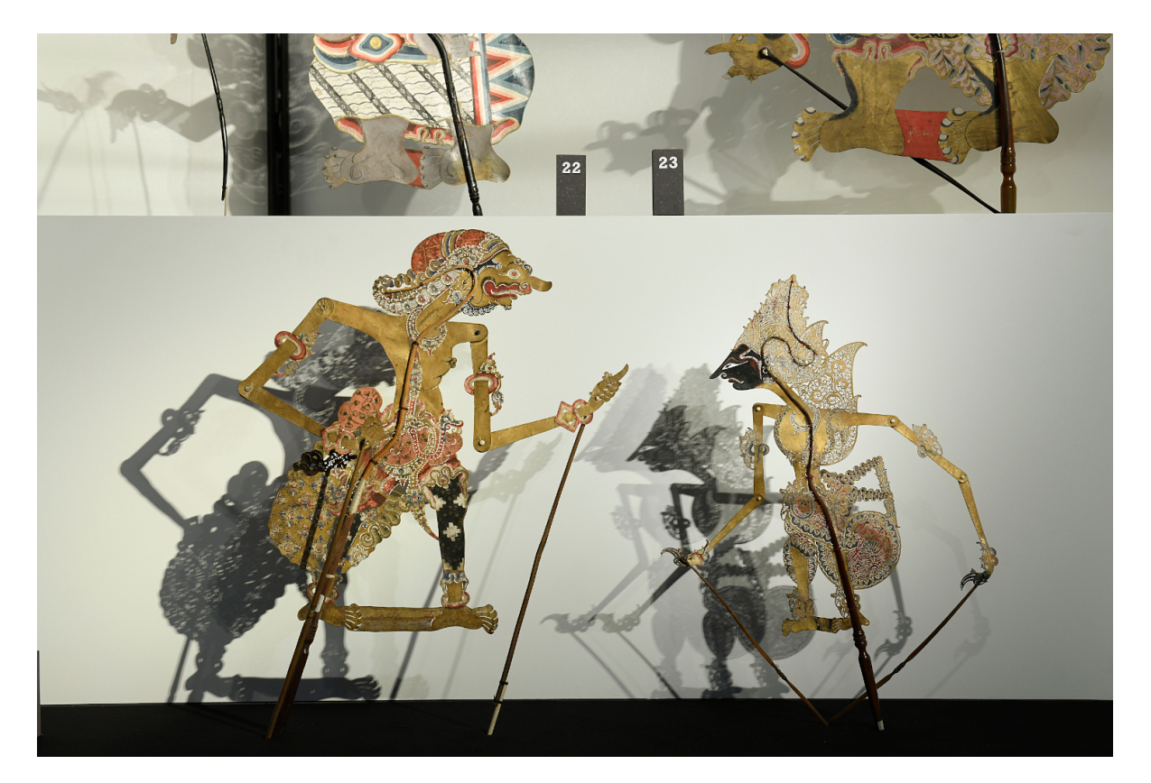
Figure 5 Wayang Kulit figures presented in a standing position and arranged according to their individual characters. Sengkuni (left) has a treacherous character; Kresna (right) acts with noble intentions. Arrangement by Eva von Reumont. Left : Sengkuni, 19th century, 47 x 33 cm, Museum Rietberg, acc. no. 2017.578. Right : Kresna, 19th century, 41.5 x 21.5 cm, Museum Rietberg, acc. no. 2017.566.