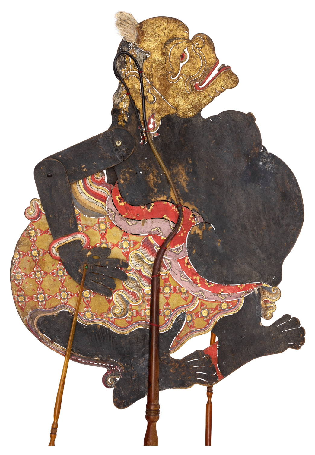
Figure 9 Semar is the incarnation of the highest ancestor, Ismaya. He is supposed to be very ugly. His physiognomy thus does not conform to the system of halus and kasar. Semar, Central Java, 19th century, 44 x 36 cm, Museum Rietberg, acc. no. 2017.561, Gift of Tina and Paul Stohler.