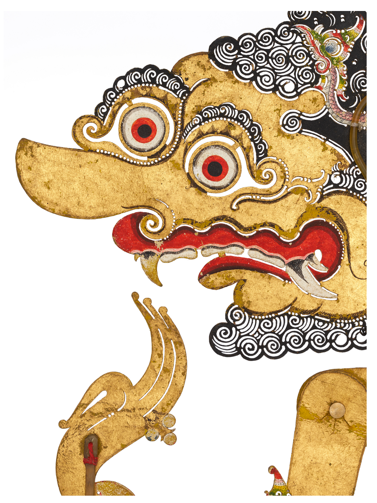
Figure 6 Round bulging eyes, open mouths, and sharp teeth indicate a ruthless character. Rajamala, Central Java, first half of the 20th century, 65 x 50 cm, Museum Rietberg, acc. no. 2017.595, Gift of Tina and Paul Stohler.