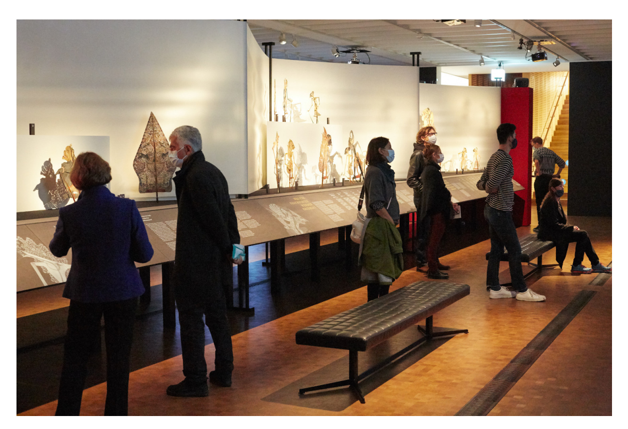
Figure 4 Visitors at the exhibition wearing masks as part of Covid-19 protocol.

atre: Stories about Life and the World. <sup>16</sup> For us as curators it was important to make the figures and the characters, they represent the centre of attention and to treat them as individual agents. In most earlier Wayang Kulit exhibitions, the puppets were sewn onto fabric and presented in a two-dimensional manner (von Reumont 2017, 125–47). We decided to show them in a three-dimensional standing position by inserting their handles into an Ethafoam<sup>®</sup> base. Several of the most important protagonists were described in terms of their character traits, and the role their attitudes, faults, and virtues played within the stories was explained (Fig. 5). This in-depth approach was new for an exhibition on this theatrical tradition and allowed the underlying ethical message to be discreetly revealed to the visitor. It was also important to demonstrate that Javanese Wayang Kulit, as a form of both moral instruction and skilful entertainment, is still very much alive today. We therefore offered short, contemporary films on the nocturnal world of light and shadow, backstage procedures, and the elaborate production process of the figures. The exhibition layout was enhanced by a beautiful soundtrack of audio sequences from the film footage, which presented the music of the Gamelan orchestra as well as the voices of the puppeteers, singers, and audience (von Reumont 2020).