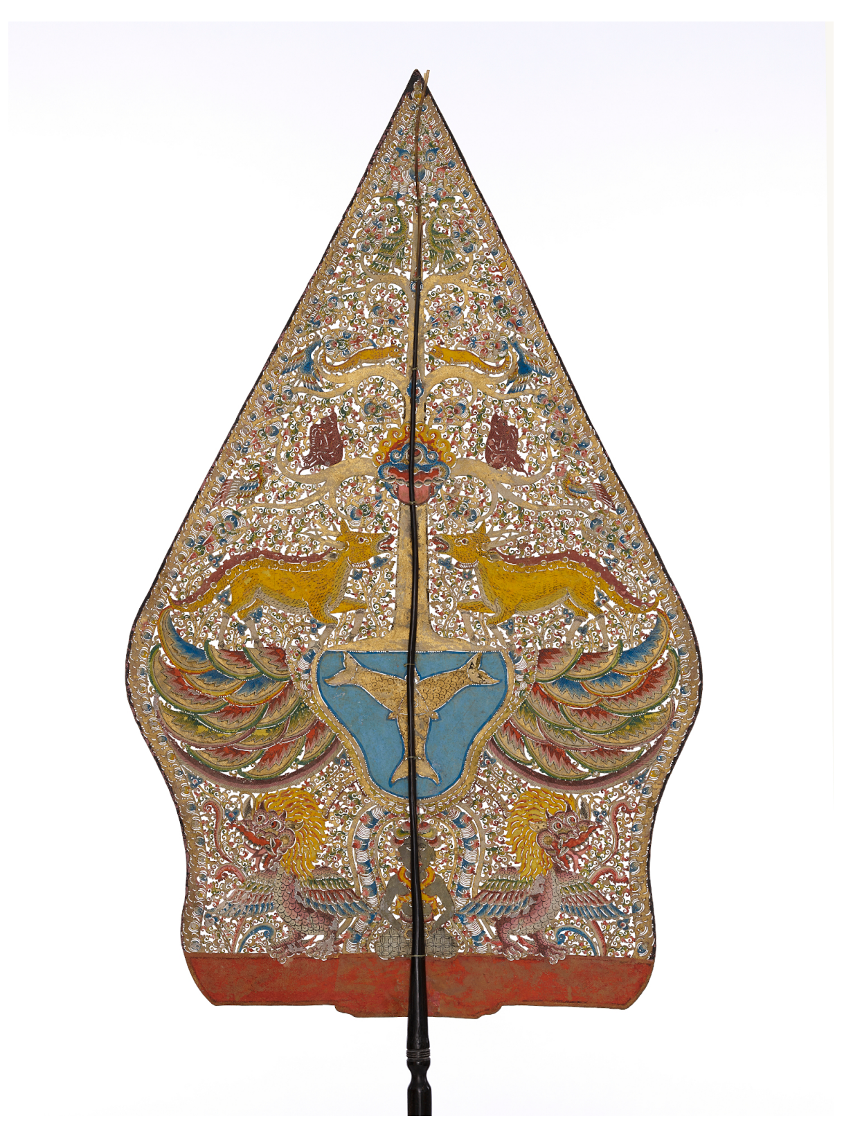
Figure 10The Gunungan displays the tree of life with many animals. Gunungan, Central Java, 19th<br/>century, 77.5 x 47 cm, Museum Rietberg, acc. no. 2017.602, Gift of Tina and Paul Stohler.<br/>Photo by Rainer Wolfsberger.