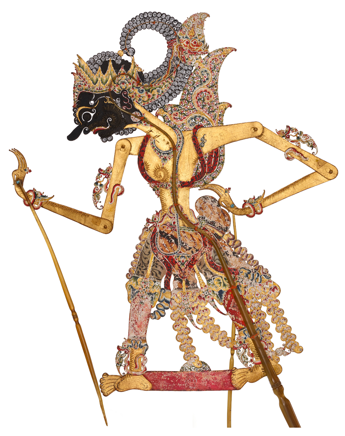
Figure 7 Bima's son Gatotkaca is incredibly strong with supernatural powers. His character is bold yet humble, and his behaviour shows great virtue. Gatotkaca, Central Java, 19th century, 58 x 34 cm, Museum Rietberg, acc. no. 2017.584, Gift of Tina and Paul Stohler.