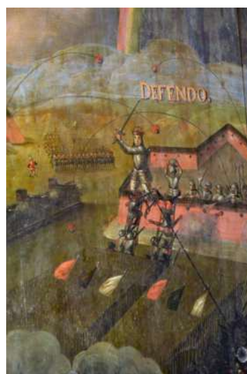
FIGURE 14 The landlord: “Defendo”.

addressing those who work in the fields, i.e. the rural residents (peasants); decoration of the benches, addressing those who defend, i.e. the Schacks; and a unique pulpit, pointing to those who exercise spiritual care (Fig. 13, 14, 15, respectively). That the physical space of the church should also represent a stable social order was already recognized by Martin Luther in his sermon at the opening of the chapel of the castle in Torgau in 1544. The many “Kirchenstuhlordnungen” of the sixteenth