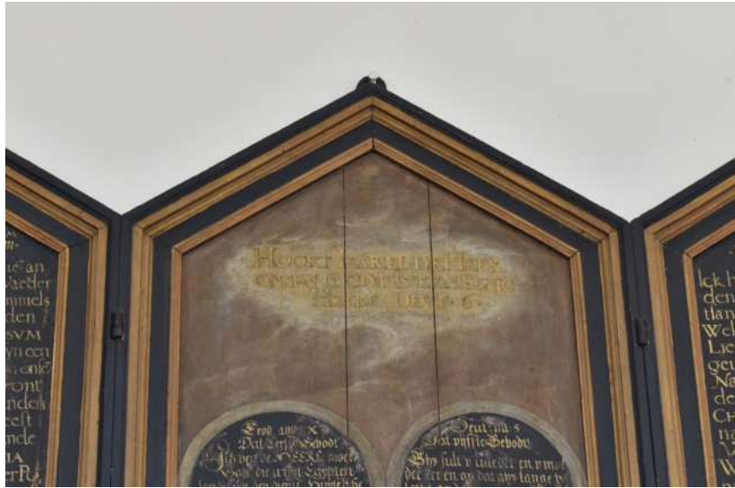
FIGURE 5 Detail of text triptych in Bourtange, 1611, photo by author.

can be seen in the upper area of a panel in Bourtange (1611, Fig. 5), where an illuminated cloud contains the phrase “Hoort Isarel de Heer onsen Godt is een eenig Heere” (Deut. 6:4). 14