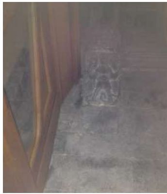
FIGURE 10 Corbel in the north transept, a biblical Joshua with a bunch of grapes.