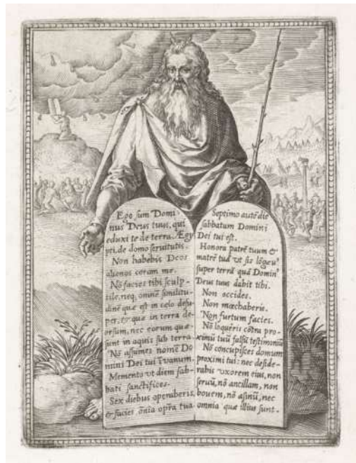
FIGURE 7 Johann Sadeler (I), after Crispijn van den Broeck, Moses with the Tablets of the Law, 1575, Rijksmuseum, Amsterdam.

An Antwerp print by Johan Sadeler (I), based on a design by Crispijn van den Broeck (1571) and depicting Moses with the tablets of the Law, demonstrates the close iconographical relationship of Moses scenery in print and on panels (Fig. 7). Its subject matter and composition is very similar to the Utrecht example.