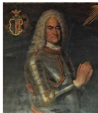
FIGURE 3 Portrait of Schack von Wittenau

furnishing was commissioned by the Schacks, was initially attached to the church benches and was decorated with emblems (Schmid 1906, 197). Additionally, liturgical vessels, ordered in Elblag, indicate by their inscriptions the Schack family's patronage of the church equipment and their role as the guardians of the church. This coat of arms can also be found on the funeral banner in Susz for Albrecht Wilhelm Schack von Wittenau, showing a deep red and blue chessboard and a wolf placed on the red background (Schmid 1906, 197-198; Fig. 3).