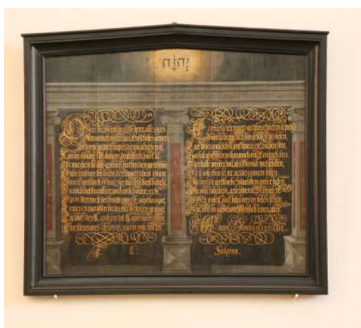
FIGURE 10 Panel with texts from the New Testament, Sneek, 1632, photo archive Regnerus Steensma.

Other contemporary Ten Commandments panels with Moses imagery show a strong similarity to the discussed Utrecht Ten Commandments painting. A similar composition, the same subject matter and design for the background scenery, and even similar colours, recur repeatedly. Very similar to the Utrecht canvas is, for instance, the Ten Commandments panel currently located in a church at Lunteren (c.1575–1650, Fig. 8). 20