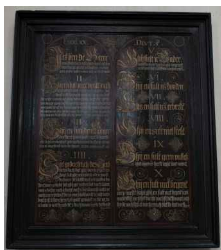
FIGURE 1 Ten Commandments panel, Bovenkerk Kampen, 1634, photo by author.

The Ten Commandments were among the central texts in Reformed doctrine and Reformed liturgy. The churchgoers were familiar with this text as well as with the Lord’s Prayer and the Creed. These texts were recited during church services, they were an important part of catechism teaching, and were even used to teach children how to read (Spaans 2004, 456n173).