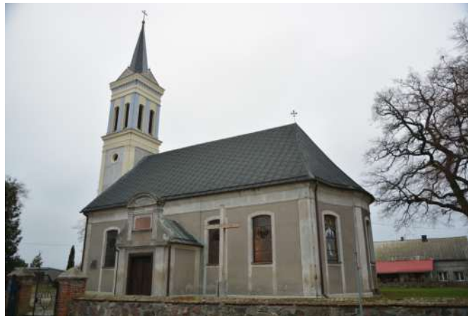
FIGURE 1 Rodowo Church exterior.

The new owners of the village took care of the first Catholic and later Protestant wooden church in Rodowo while at the same time investing in church decorations in Susz. In Rodowo, an earlier church building had been attacked during the invasion of Polish troops fighting near Prabuty during the so-called “war of starvation” in 1414. In 1543, the church was described as completely destroyed. We have no information about its appearance or its church furniture, and can only assume that there were fairly long periods when the village had no church at all. No further details are known of the next, probably wooden, church from 1624, mentioned in the Prabuty city financial account books edited in the years 1689/1690 (Kaufmann 1937, 178). The next church, which is the focus of this investigation, was built in 1754 (Fig. 1). In all likelihood, it was of similar shape and had the same dimensions as the previous church. The date of the construction of the new building is preserved on the inscription above the south portal of the church. On the balustrade of the choir, one can read the name “Johann