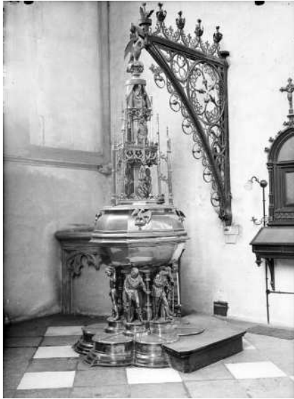
FIGURE 2 Baptismal font in the Sint Jan's Cathedral, 's-Hertogenbosch, 27 February 1929.

had proved impossible to remove in 1629, was mentioned as an artistic masterpiece (van Oudenhoven 1649, 24). The Renaissance-style rood screen