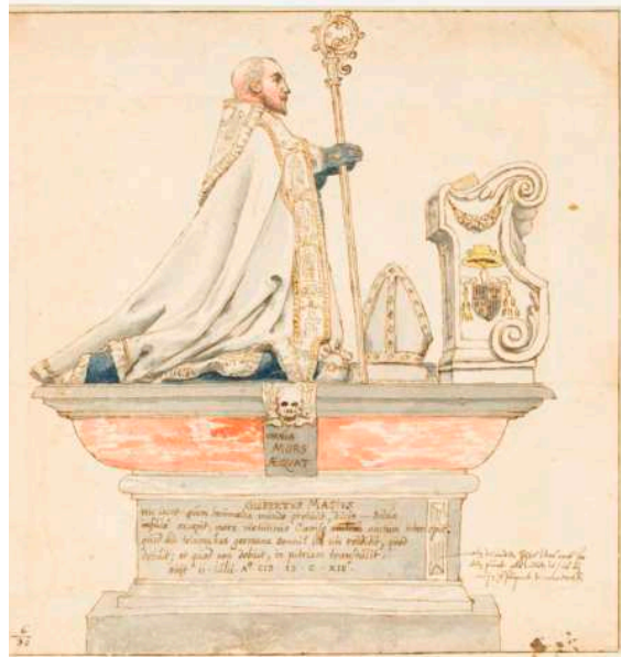
FIGURE 6 Tomb Monument Bishop Gisbert Masius, drawing Pieter Saenredam 1632.