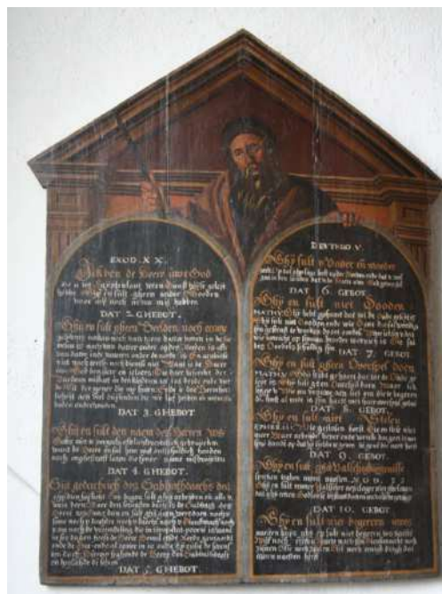
FIGURE 14 Ten Commandments panel, Tricht, c.1575-1650

and as an exemplary, rather than a saintly, figure. However, Moses appears in a mediating role on Ten Commandments panels, presenting the tablets of the Law to the beholder, following the biblical narrative in which he fulfils a role of an intermediary between God and people. This role pleads for a further analysis of the possible place and function of ‘Moses panels’ within the Reformed church interior and its liturgical use, compared to the former medieval Catholic use of the church.