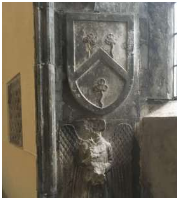
FIGURE 9 The Lynch window and altar tomb, with the carving of an angel, now defaced, in the south transept.

period which remains in regular use is the beautifully carved baptismal font located at the back of the south aisle between the west door and the south porch (Fig. 11). In England, canon 81 of 1604 ordered the provision of a stone font for baptism, and Galway's font must have been provided about the same time (Yates 2008, 73).