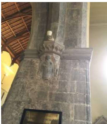
FIGURE 6 Intact angel high in the archway at the junction between the south aisle and south transept.

found in the south transept (Fig. 9); and up high in the north transept is a corbel with a Tudor carving, apparently of a Biblical Joshua holding two bunches of grapes (Fig. 10). Some traces of dark paint survive on some of these carvings, which, when first erected, would have been elaborately painted.