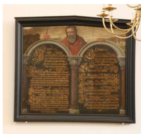
FIGURE 11 Ten Commandments panel, Sneek, 1632

Its imagery and composition is (although inverted) almost exactly the same as on the Utrecht painting: the bust of Moses, bearded and dressed in red cloth, is centrally depicted above the two tablets, while he holds his rod in his right hand and lets his left forearm rest on the other panel. Several Frisian panels are adorned with very similar imagery. A panel in