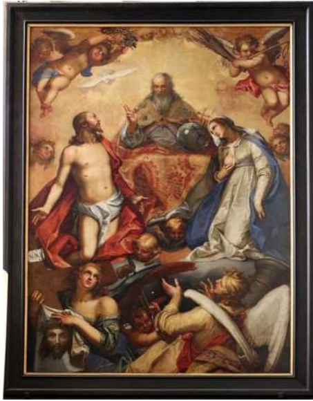
FIGURE 1 Abraham Bloemaert, God with Christ and the Virgin as Intercessors, 1615.

While he ignored this, he mentioned another highly contentious piece of Sint Jan's church furniture, the tabernacle or Sacramentshuysken , which