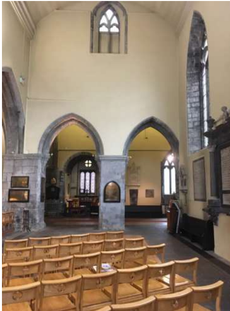
FIGURE 1 South aisle of the Collegiate church, looking towards the Chapel.

associated with the Reformation, although they probably had little to do with it.