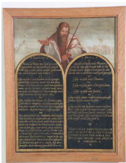
FIGURE 12 Ten Commandments panel, Bolsward, 1580-1592

Joure, dating from 1648, strongly reminds us of the Utrecht and Lunteren pieces (Fig. 9). The Martinikerk in Sneek possesses a Ten Commandments panel with similar Moses imagery (Fig. 11) that has a counterpart with texts from the New Testament, adorned with the Tetragrammaton (1632, Fig. 10). The same imagery and composition also recurs on the earlier panel in