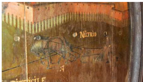
FIGURE 13 The peasant: “Nutricio”.

visual display of multiple biblical and social threads in the sermons. The