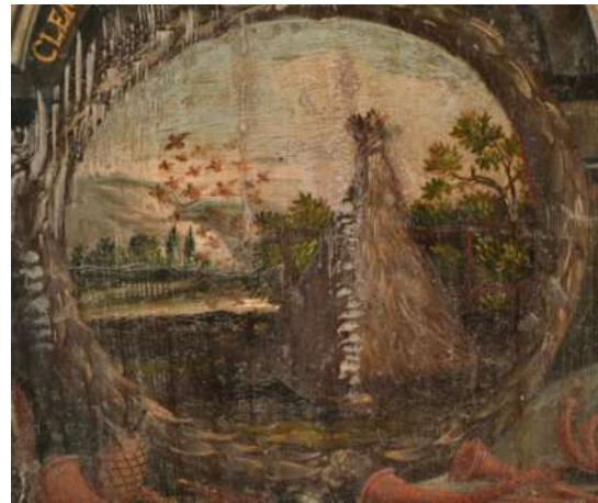
FIGURE 8 Depiction of emblem "Air".

in praise of Louis XIV to decorate their small and remote village church in Rodowo, remains unclear.