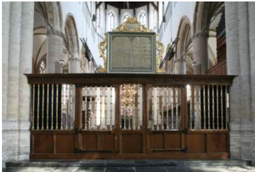
FIGURE 15 Ten Commandments panel, Leiden, c.1572-1625

churches. In the village church in Noordwijk, a Ten Commandments panel is placed on the choir screen, flanked by two panels with the Creed and the Lord's Supper, all of them inscribed on both sides (1624; Fig. 16). A choir screen with a Ten Commandments panel is part of the Reformed interior of the church in the Frisian village of Kimsward (1695; Fig. 17).