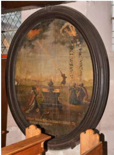
FIGURE 9 The power of prayers.

frames and hung directly under the galleries in the western part of the church. So far, we have no information about the artist and the workshop where they were made, but it is worth analyzing their content. Three of the paintings relate to prayer as an important element of spiritual life, in which