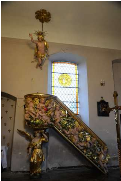
FIGURE 2 Rodau pulpit J. Doebel, Johannes Soeffrens

Heinrich Selcke”, the signature of either the local minister or the carpenter who probably worked on the construction of the church. The originally towerless building was adorned with a tower in 1859, thanks to the efforts of an unknown local parish priest.