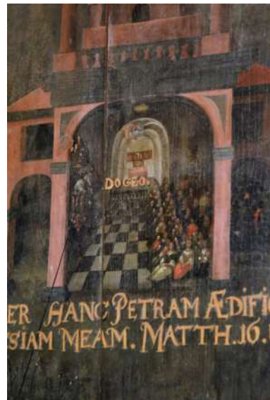
FIGURE 15 The pastor: “Doceo”.

A talented, unknown painter (perhaps from the artistic centre of Königsberg) created this cycle of four prayer paintings in Rodowo. He positioned the subtitles freely, rather than within the frames. Subtitles “imprisoned” in frames were very popular in the sixteenth century, in which medieval tradition was maintained (Michalski 1982, 173–174). Positioning inscriptions outside of frames and positioning them directly in the image’s background is not unusual in medieval art in the Netherlands up to the end of the sixteenth and the beginning of the seventeenth century (Johann Krell, Anti-Calvinistic Allegory, 1590–1595 , Museum of State History, Leipzig), but the paintings in Rodowo are probably the only example in Ducal Prussia (Michalski 1982, 194). The iconographic source of inspiration is also important. In the case of easel paintings, it is noticeable that the artist based his composition on unknown graphic examples, which may have been amended by the unknown (local?) priest or the patrons of the church. Their visual message, supported by the minister in his sermon, enabled the uneducated people of Rodowo and neighbouring villages belonging to the Schacks to soak up the content of the Bible more easily.