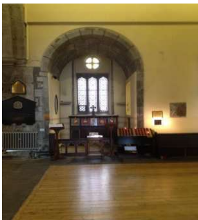
FIGURE 12 The Chapel of Christ, in the south transept.

disapproval (Hardiman 1820, 246; Leask 1936, 2-23). Assuming it once housed the reserved sacrament, its originally intended use must have been short-lived. Also of early Tudor date is the holy water stoup now in the north aisle (Fig. 13). Although likewise soon redundant in its original role, it is of a rare and costly freestanding type, which presumably explains its survival. 14 Given the expense of providing a replacement if, as was widely expected, Catholicism should be restored, even bulky “monuments of superstition” were