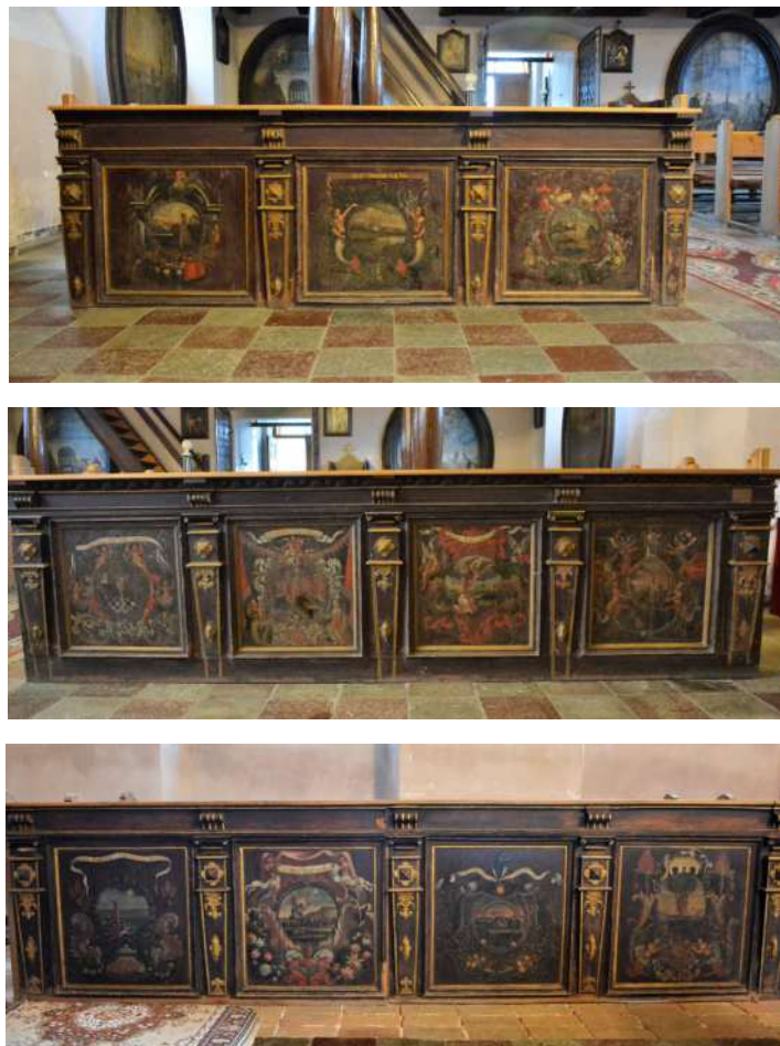
FIGURE 4, 5, 6 Decoration Benches.

different spaces within the church where they were arranged. The piety of the local landlords is visualized in the emblematic decoration, while the paintings refer to the devotion of the rural residents of Rodowo. Each emblem was modified and contains only lemma and imago, without an epigram. The use of emblems in the decorative programme of Lutheran churches has received some scholarly attention in recent years. Mara R. Wade, following the groundbreaking studies of Katarzyna Cieślak, for instance, has carefully analyzed the emblem programme in Lutheran churches in Gdańsk. She and Cieślak diagnose a strong presence of