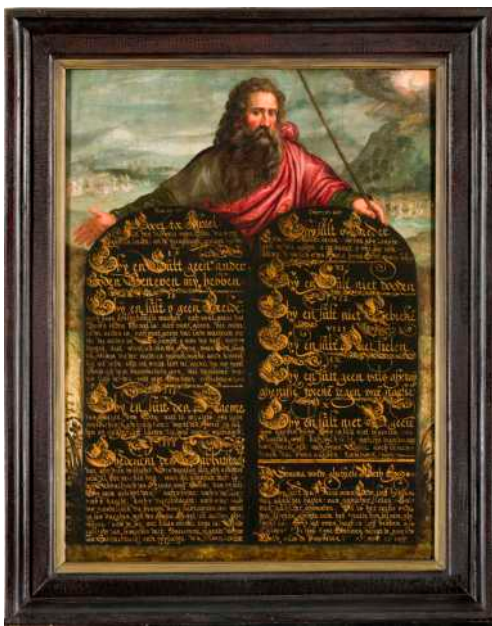
FIGURE 6 Ten Commandments painting, c.1600-1625, Museum Catharijneconvent, Utrecht, RMCC s13.