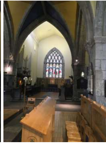
FIGURE 5 Chancel with high altar and choir stalls.

In regard to these new services, the rubrics of the Elizabethan prayer book provided that common prayer “shall be used in the accustomed place of the church, chapel, or chancel” (Booty 2009, 48). No doubt in Galway this often meant in the nave, with a reading desk positioned just outside the chancel for the minister to read the service. The enhanced status of the offices, or common prayer, in public worship was also underlined by a revised clause in the preface to the Book of Common Prayer which explained that, while priests and deacons should daily say Morning and Evening Prayer either privately or openly, “the curate that ministreth in every parish church or chapel ... shall say the same ... where he ministreth,