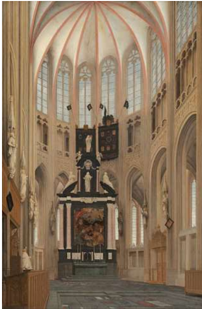
FIGURE 5 Pieter Saenredam, Cathedral of Sint Jan at 's-Hertogenbosch (1646).