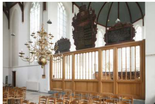
FIGURE 16 Text panels on top of the choir screen, Noordwijk, 1624, photo archive Regnerus Steensma.