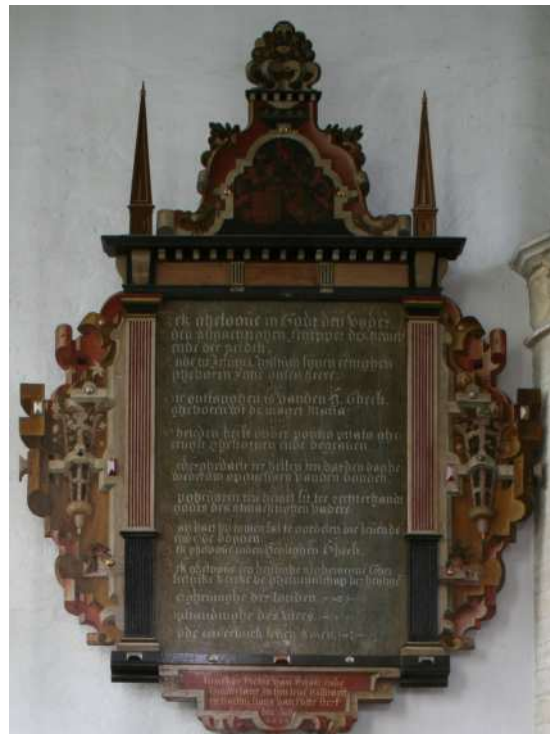
FIGURE 3 Panel with the Creed, Geervliet, 1599, photo archive Regnerus Steensma.

It is, similarly to many other panels, shaped as an ‘aedicula’, resembling temple architecture. This aedicule, or temple shape, was ubiquitous in the sixteenth and seventeenth century in a variety of different media. Within the church space, it was a familiar way of framing other categories of panels, such as epitaphs. In print, it often recurs on title pages of Bibles, most notably on the title page of the seventeenth-century Dutch ‘Statenvertaling’ (1637). 10 Its appearance in this authoritative Bible translation may illustrate the weight or status this design could add to a panel.