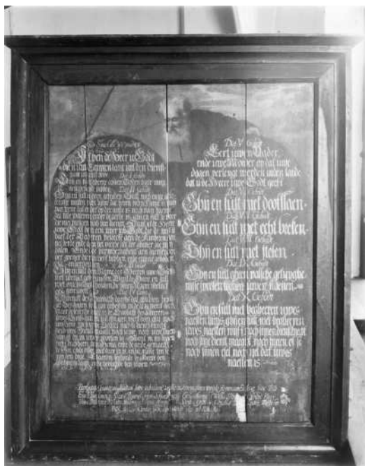
FIGURE 13 Ten Commandments panel, Herveld, 1697. Collectie Rijksdienst voor het Cultureel Erfgoed, object no. 43.342.