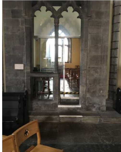
FIGURE 2 View into the Chapel of the Blessed Sacrament from the nave.