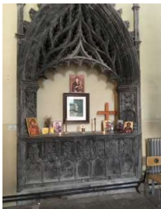
FIGURE 7 The ‘flamboyant’ wall tomb in the south transept.