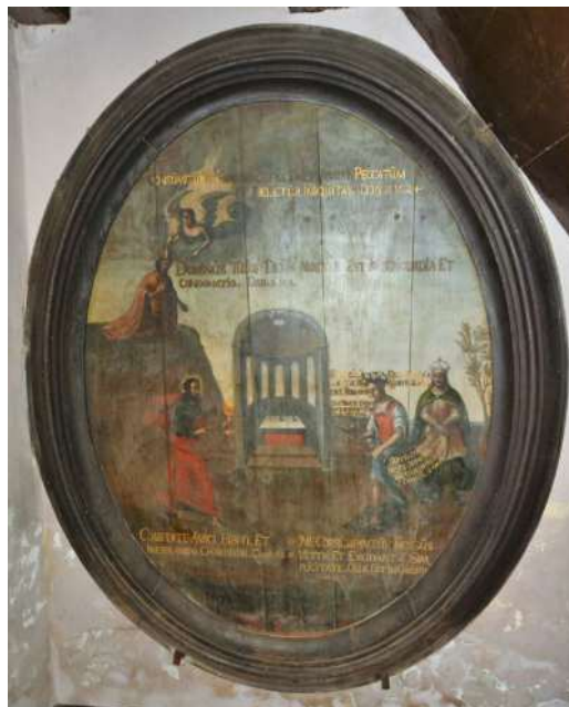
FIGURE 10 The spiritual freedom of man.

The second painting directs our attention to spiritual life, evoking the Old Testament prophet Daniel's prayer and grace received from God (Fig. 10). In the Old Testament, God's grace is received through good deeds; in the New Testament, it is obtained freely, by grace through faith. The texts attributed to Daniel (from the book of Daniel chapter 9, v. 9) talk about this: "Tibi autem Domino Deo nostro misericordia et propitiatio, quia recessimus a te" (To the Lord our God belong mercy and