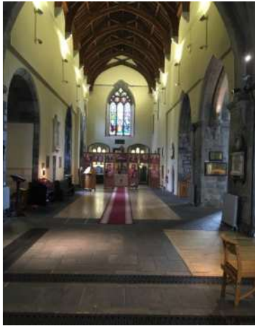
FIGURE 3 View of the south transept, with ikons of the Romanian Orthodox church.

In its place came prayer book services in English, with a liturgy emphasizing “common prayer”, interspersed with scriptural readings, and, on Sundays and holy days, including a homily or sermon. Priest and people worshipped together, with the congregation now expected both to understand and to participate.