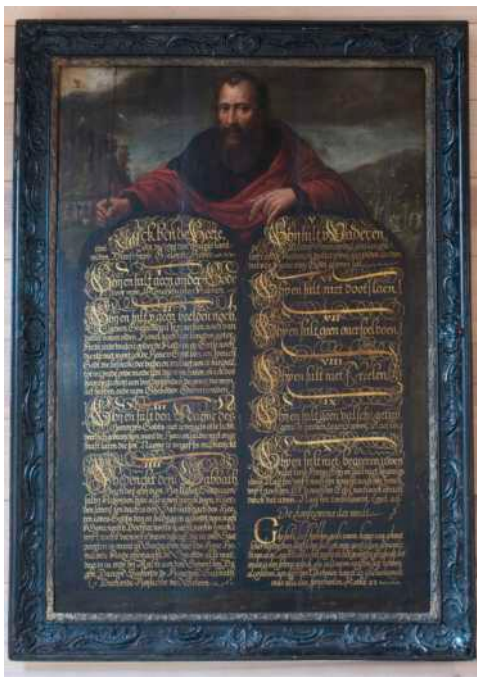
FIGURE 8 Ten Commandments panel, Lunteren, c.1575-1615

the Law. On the left, Moses receives the tablet of the Law on Mount Sinai, while the kneeling people pray at the foot of the mountain. A thick cloud hovers over the mountain, on which a tiny Moses figure with the tablets of the Law is visible. The Biblical passage also mentions the loud voice of a trumpet: several horns appear in the godly cloud (Ex. 19:16). On the right side of the central Moses figure, the Israelites' encampment is depicted with the worship of the golden calf in front of it. The tents bear a striking similarity to those on the Utrecht canvas. The golden calf on the Antwerp print is placed on a more customary, antique-looking column. A noteworthy difference to Ten Commandments panels is that the text on the Antwerp print is inscribed in Latin, whereas on church panels, the text is always in