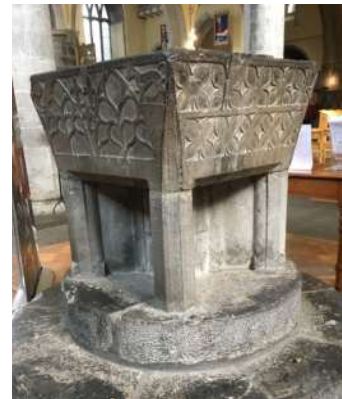
FIGURE 11 The stone baptismal font towards the rear of the south transept, between the west door and the south porch.

Another prominent feature of medieval churches which fell into disapproval during the Tudor reform were the various side chapels with their altars. The Collegiate church once had no less than thirteen of these, but only two enjoyed an attenuated existence into modern times (Fig. 12). The chapel of Christ holds the oldest tomb in the church, known as the Crusader's tomb. The most recent, the chapel of the Blessed Sacrament built between 1538 and 1561, attests to the popularity of traditional belief in the Real Presence on the eve of the Reformation, at just that time when the Eucharistic doctrine, which its name implies, fell under