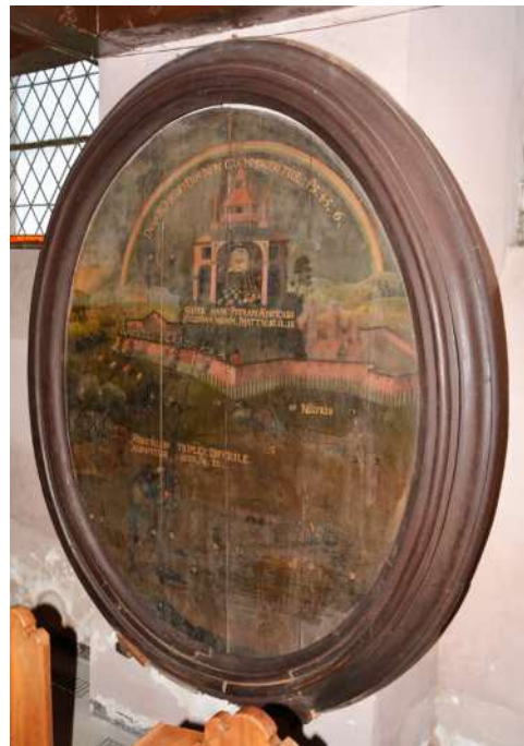
FIGURE 12 The visual structure of society.