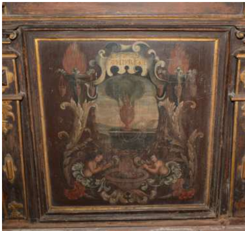
FIGURE 7 Depiction of emblem "Fire".

The emblem ensemble in Rodowo and its particular motifs are unique in Ducal Prussia. In other churches, the nobility preferred to represent themselves and their leadership virtues through a display of their coat of arms. This was easy for the reviewers to read. The Schacks followed this practice in their main church in Susz, but why they preferred this intellectually more ambitious programme of emblems, initially designed