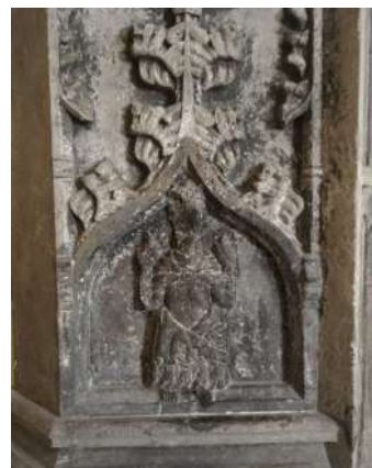
FIGURE 8 Detail showing the five wounds of Christ on the ‘flamboyant’ wall tomb.

In place of ornaments and images, the church was to purchase both a poor box and a copy of “the whole Bible of the largest volume in English ... and the same set up in some convenient place” (Frere and Kennedy 1910, iii, 10, 16-17) in the church, perhaps on the brass lectern acquired in 1546. In Dublin, two large bibles were set up in the cathedrals “for the instruction of those whoe pleased to hear them read” (White 1941, 235). The poor box was an official reminder that charity should be directed to needy people made in God’s image in place of offerings to graven images. The money collected from fraternities and guilds attached to the church’s now redundant side chapels (discussed below) was also to be placed in the poor box. These days, the one item of church furnishing from the late Tudor