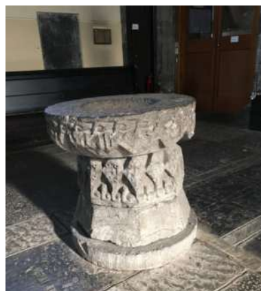
FIGURE 13 The Holy Water stoup, north transept.

illicitly dismantled and buried rather than destroyed. In Kilkenny, for instance, when Queen Mary’s proclamation permitting the celebration of Mass reached the town in summer 1553, the cathedral clergy of St Canice’s “suddenly set up all the altars and images in the cathedral church” during a short absence by their fervently Protestant bishop, John Bale. Earlier, they had likewise “brought fourth their copes, candelstickes, holy waterstocke, crosse and sensers [and] mustered fourth in generall procession” chanting the old Latin Litany (Parke 1810, 452. Cf. Ellis 1984, 290).