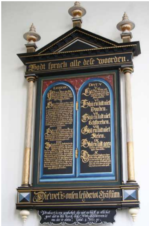
FIGURE 2 Ten Commandments panel, Beusichem, 1627, photo archive Regnerus Steensma.