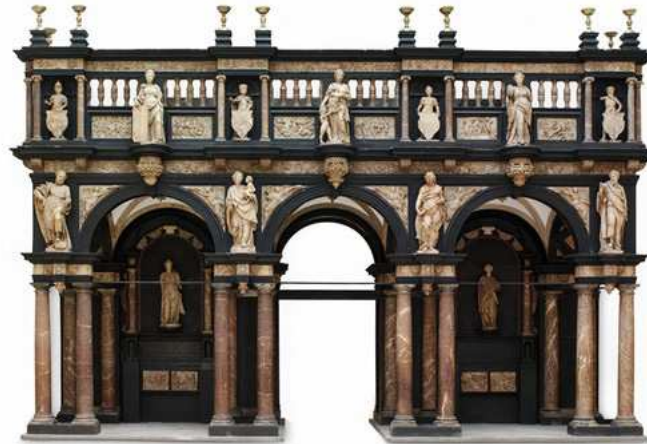
FIGURE 3 Carved marble choir screen, by Coenraed van Norenberch, 's-Hertogenbosch, Netherlands, 1600-13.

choir. So although most of what van Oudenhoven described was no longer there, it was regarded by him as significant—if not for the present, then for the history of the church and the city.