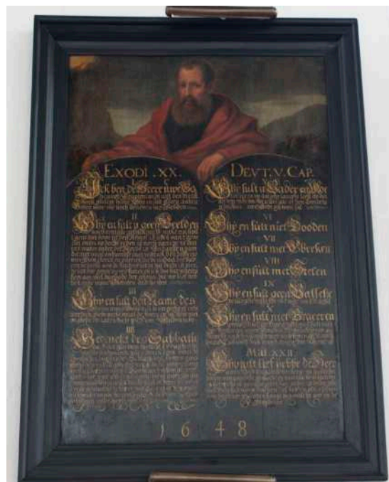
FIGURE 9 Ten Commandments panel, Joure, 1648, photo by author.

the vernacular, in accordance with the Reformed conviction that Scripture