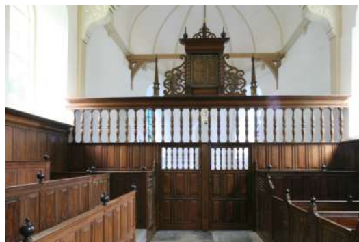
FIGURE 17 Ten Commandments panel, Kimsward, 1695.

The emphasis placed on the border between nave and chancel by means of a Ten Commandments panel in some ways mirrors the pre-Reformation structure of the church space. The chancel was the liturgical centre of the