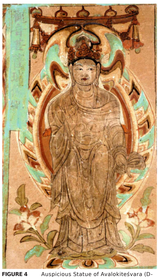
Auspicious Statue of Avalokiteśvara (D-MG 72, Five Dynasties; adapted from Sūn Xiūshēn 2000, 63, ill. 46): 觀音菩薩 瑞相紀 - Record of the Auspicious Statue of Guānyīn (Avalokiteśvara) Bodhisattva (The original statue was supposedly situated in Gandhāra).