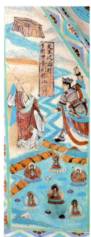
MG 237 (mid-Táng) Caption Text:天王決海時于闐國舍利弗毘沙門