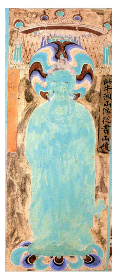
FIGURE 1 'High-speed' transmission to Mt. Niútóu; the caption reads: 此牛頭山像從耆山[=闍崛山]履空而來 'This image at Mt. Niútóu (Oxhead Mountain) came from Gṛdhrakūṭa ('Vulture Peak'), it came through treading the air.' This describes the transmission process and the emplacement of the deity by means of its 'double' in the form of a statue. As in the case of many other stories, the emphasis on speed/immediacy is noteworthy. Reproduced from Sūn Xiūshēn 2000, 88, ill.69.