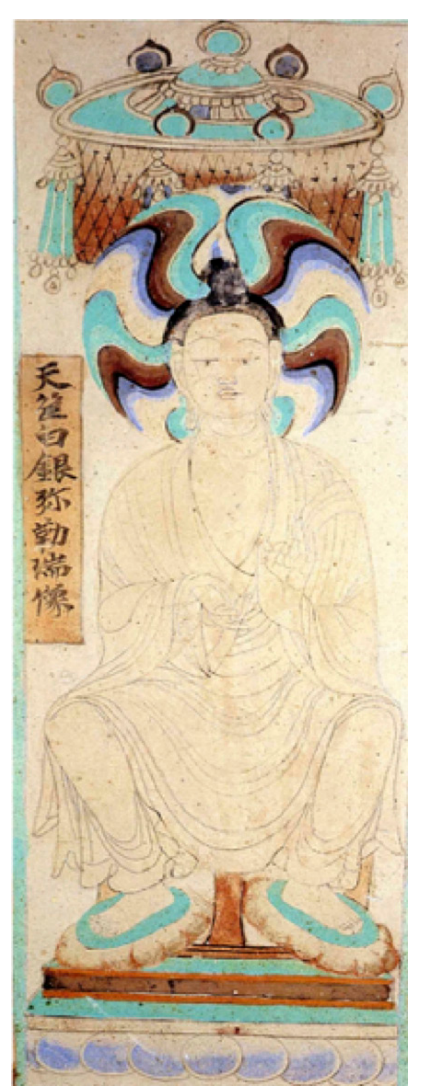
FIGURE 3 Auspicious Statue of Maitreya (D-MG 231, mid-Táng; adapted from Sūn Xiūshēn 2000, 61, ill. 44): 天 竺白銀彌勒瑞相 - The Auspicious Statue of the 'Silver-Maitreya' of India.