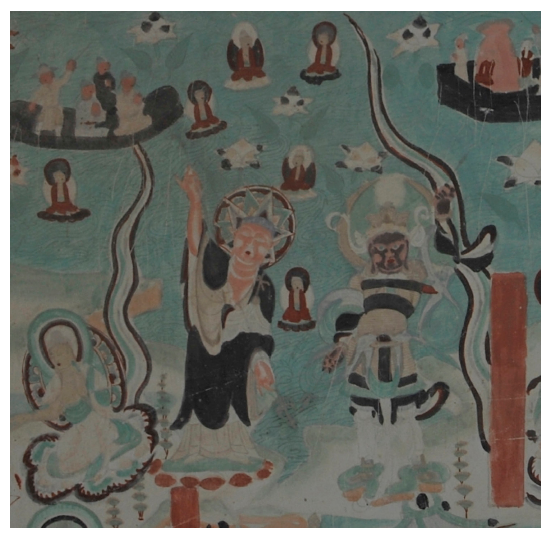
FIGURE 10 Detail of the Oxhead Mountain tableau in Cave YL 33