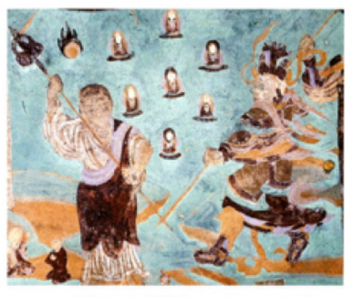
MG 454 (Sòng Dynasty)