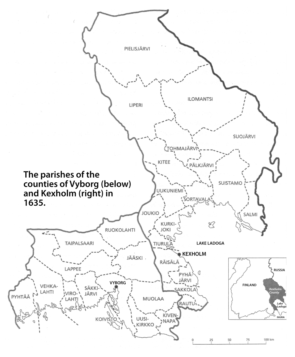
Figure 2 Parishes of Vyborg and Kexholm counties in 1635. The eastern border of Kexholm Country was the Finno-Russian border until 1940. Map by Johanna Laitila, adapted from Katajala, Kujala, and Mäkinen (2010, 243).