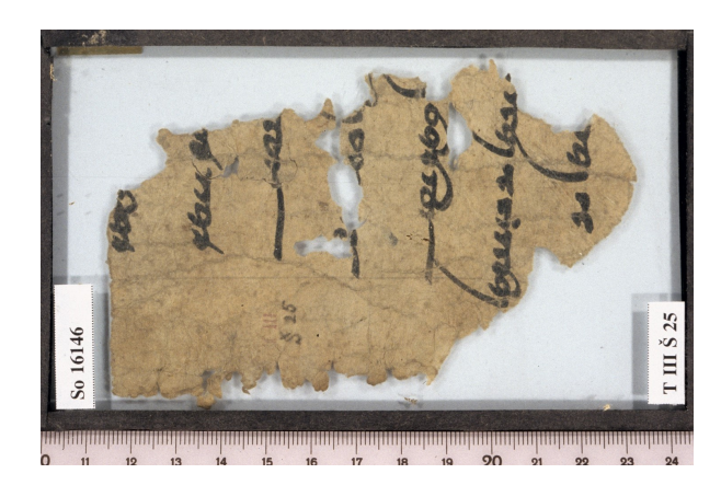
Figure 2 Photograph of So 16146.