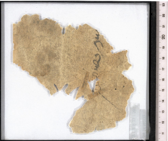
Figure 1 Photograph of So 16102(2) recto/verso.

ability remains that they could represent parts of Zoroastrian literature. Unfortunately, most of these uncertain fragments are very small and lack relevant names or items which would allow ascertaining the religious affiliation. Neither do they show formal peculiarities, which can be observed as characteristics for the literature of the several religious groups. That is the reason why such fragments will usually not be published in any way. But they are part of a limited corpus of texts, where every attestation of words is significant for further research and should be discussed. This is the first publication of these small fragments So 16102(2) and So 16146. Both are written in a distinctive kind of the cursive Sogdian script from the same hand. It is not possible to join the fragments to get a more complete text. They contain passages which can be interpreted in several directions. That is why the religious affiliation of these text fragments is not clear. In this way they point out the difficulty of determining a religion of the Sogdians in the Turfan area.