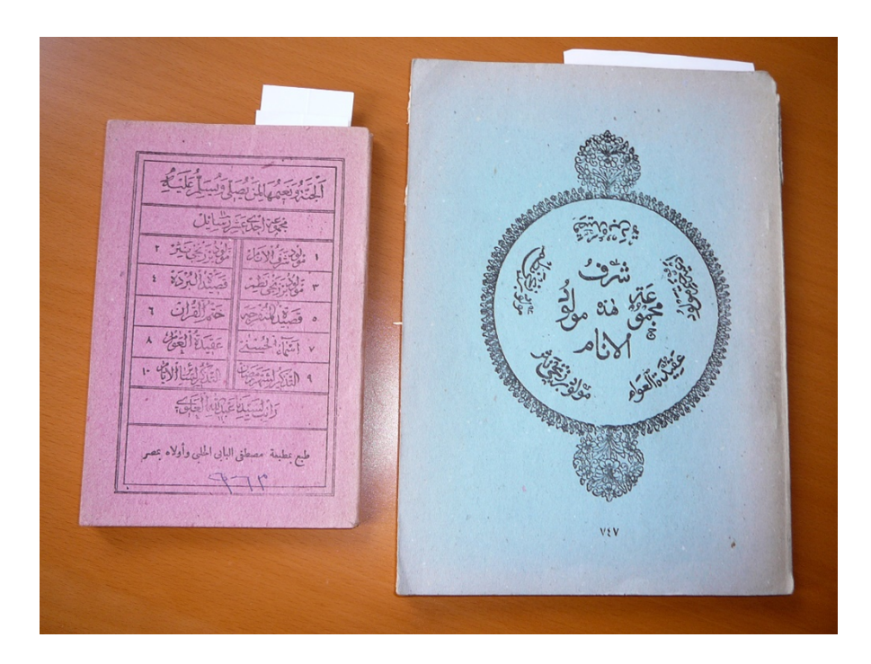
Figure 1 Title page of compilations of devotional texts including Sharaf al-anām . The book on the left was printed in Cairo ( Majm\bar{u}^c at ras\bar{a}^i il, = example No. 1), the book on the right bears no printing place ( Majm\bar{u}^c at Sharaf al- an\bar{a}m ).