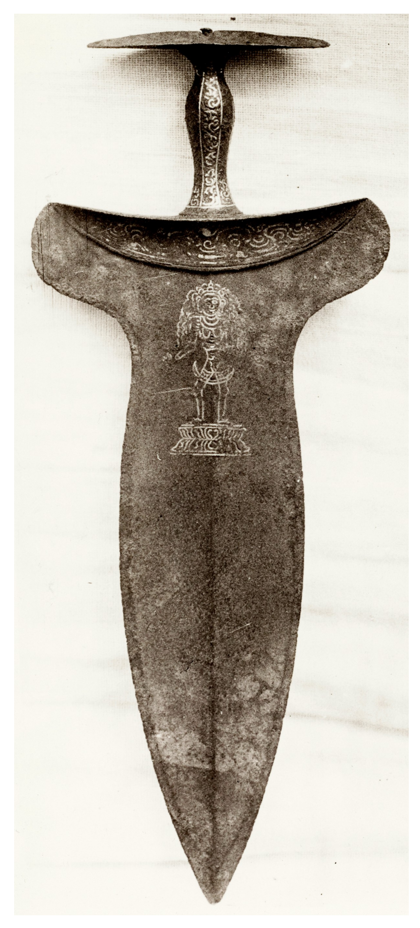
Figure 2 The Mandākinī sword and its female figure. Minangkabau regalia collection, Pagar Ruyung, West Sumatra. Licence: CC BY 4.0. Source: Leiden University shelfmark KITLV 163331 (detail).