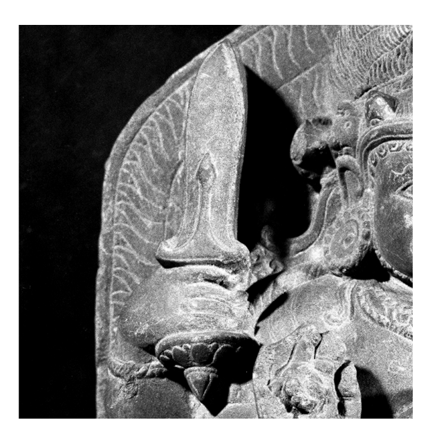
Figure 3 Two disc-pommelled swords depicted in northeastern Indian sculptures (detail). Left: Patna Museum. Right: Asutosh Museum of Indian Art. Circa 11–12th century. Courtesy of the John C. and Susan L. Huntington Photographic Archive of Buddhist and Asian Art. Scan 1979, 6306.