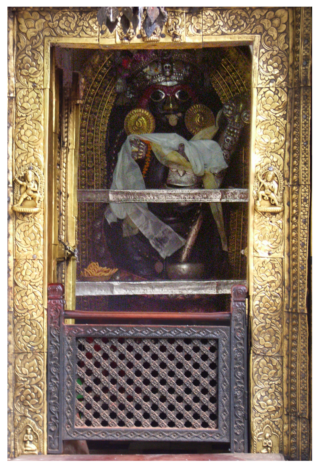
Figure 10 Two-armed Vajramahākāla enshrined at Tundikhel, Kathmandu, Nepal. 10–12th century or later.