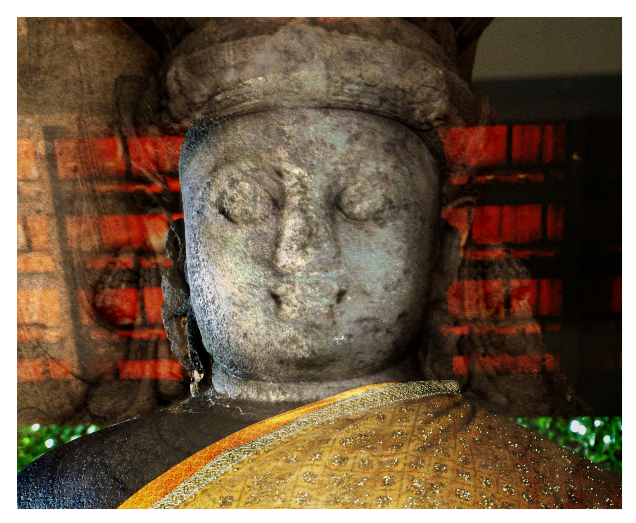
Figure 7 Superimposition of the faces of Joko Dolog and the monumental Vajramahākāla. Composite with 75% hard light layering. Source: author, 17 January 2020.