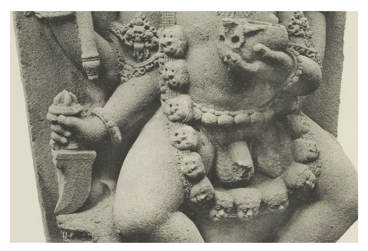
Figure 9 Vajra-handled cleaver (left) and skull (right) held by Cakracakra, Candi Singosari, Eastern Java (detail). Sinhasāri period.