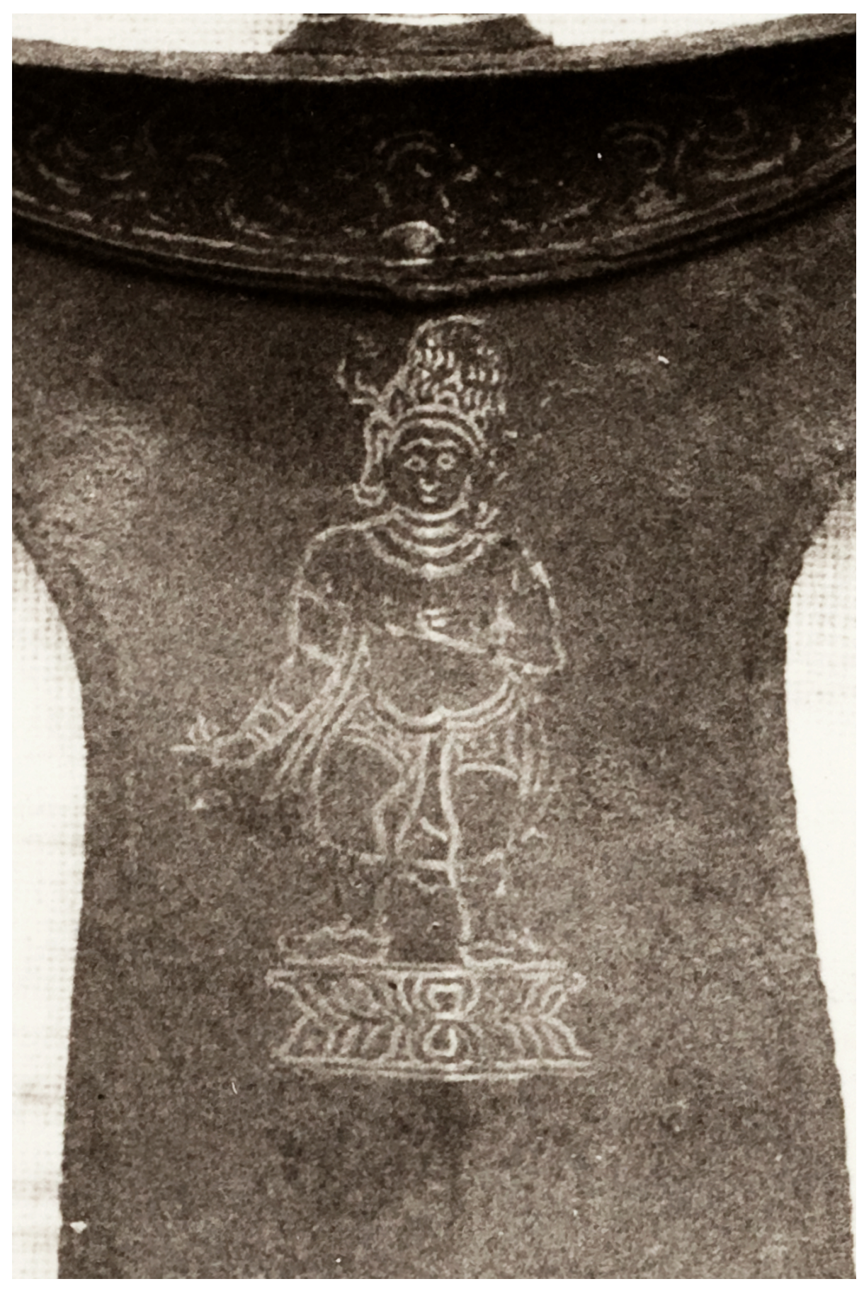
Figure 1 Male figure depicted on the Mandākinī sword (detail). Minangkabau regalia collection, Pagar Ruyung, West Sumatra. Licence: CC BY 4.0. Source: Leiden University shelfmark KITLV 163330 (detail).