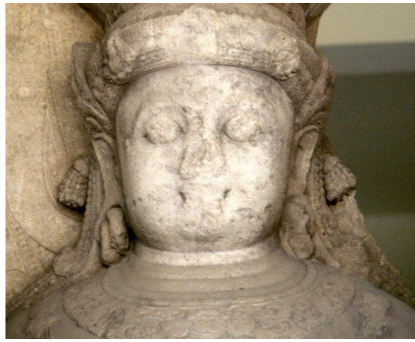
Figure 6 Two faces of Kṛtanagara. Left: Joko Dolog (Mahākṣobhya / Jñānaśivavajra). Right: Monumental Vajramahākāla.