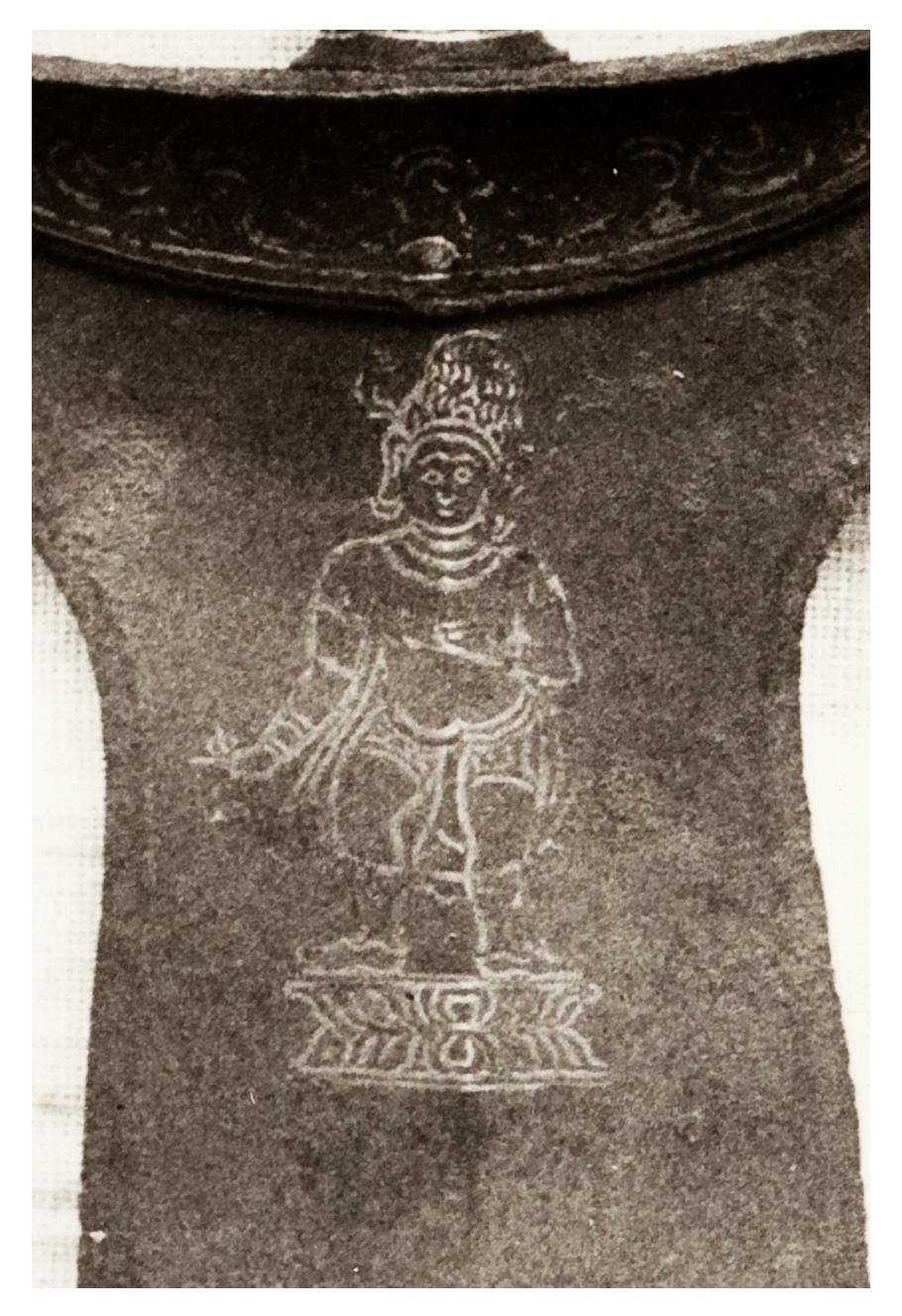
Figure 1 Male figure depicted on the Mandākinī sword (detail). Minangkabau regalia collection, Pagar Ruyung, West Sumatra. Licence: CC BY 4.0. Source: Leiden University shelfmark KITLV 163330 (detail).