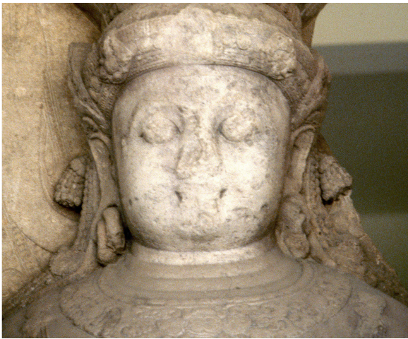
Figure 6 Two faces of Kṛtanagara. Left: Joko Dolog (Mahākṣobhya / Jñānaśivavajra). Licence: CC BY-SA 3.0. Source: photodharma.net. Right: Monumental Vajramahākāla. Source: Huntington Archive scan 52259 (detail).