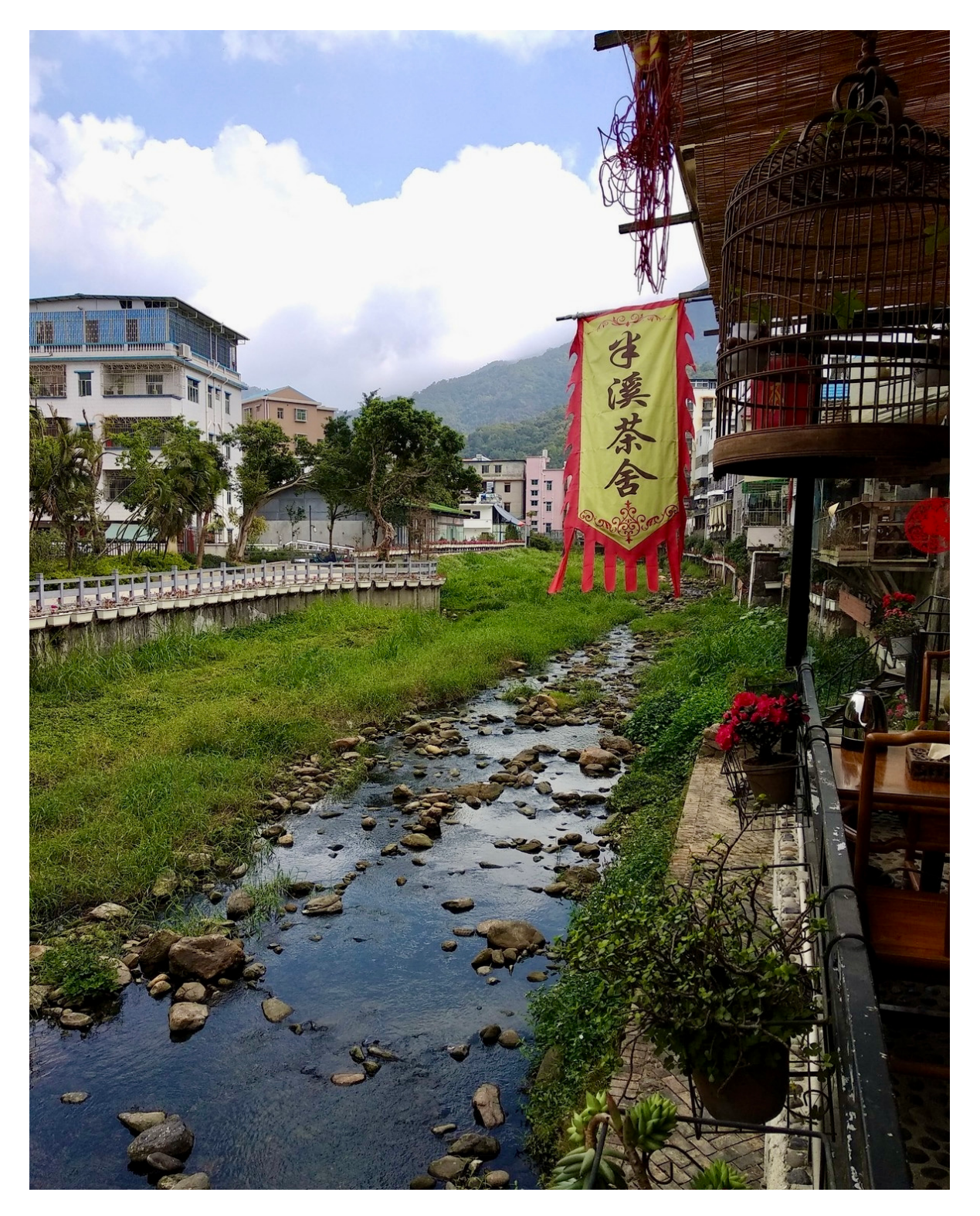
Figure 2 View of Wutong mountain from a tea house in the village.