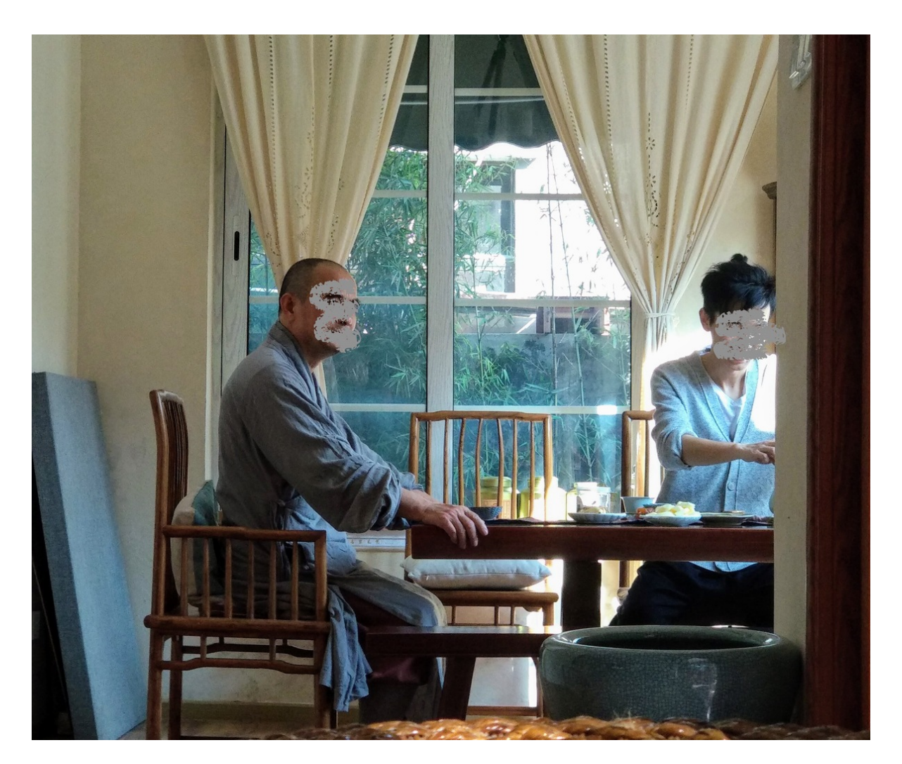
Figure 6 The Ru family tea house.

merable route choices that can be used interchangeably, while each combination provides for a different set of possible social, spatial and economic interaction" (Kochan 2015, 935).