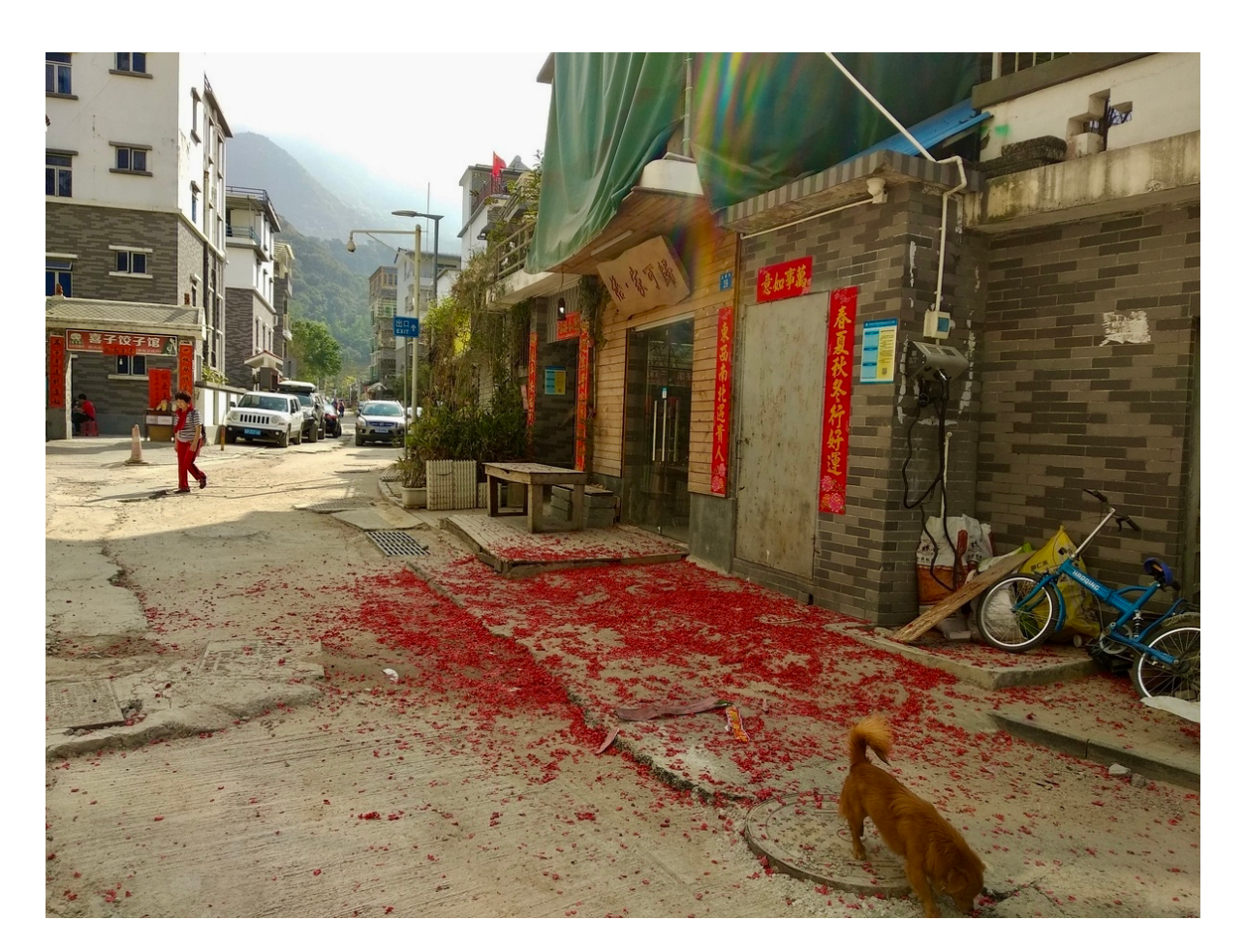
Figure 1 Wutong village streets.