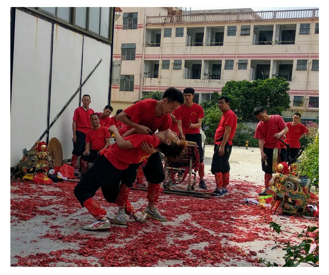
Figure 3 Hakka traditional martial art.