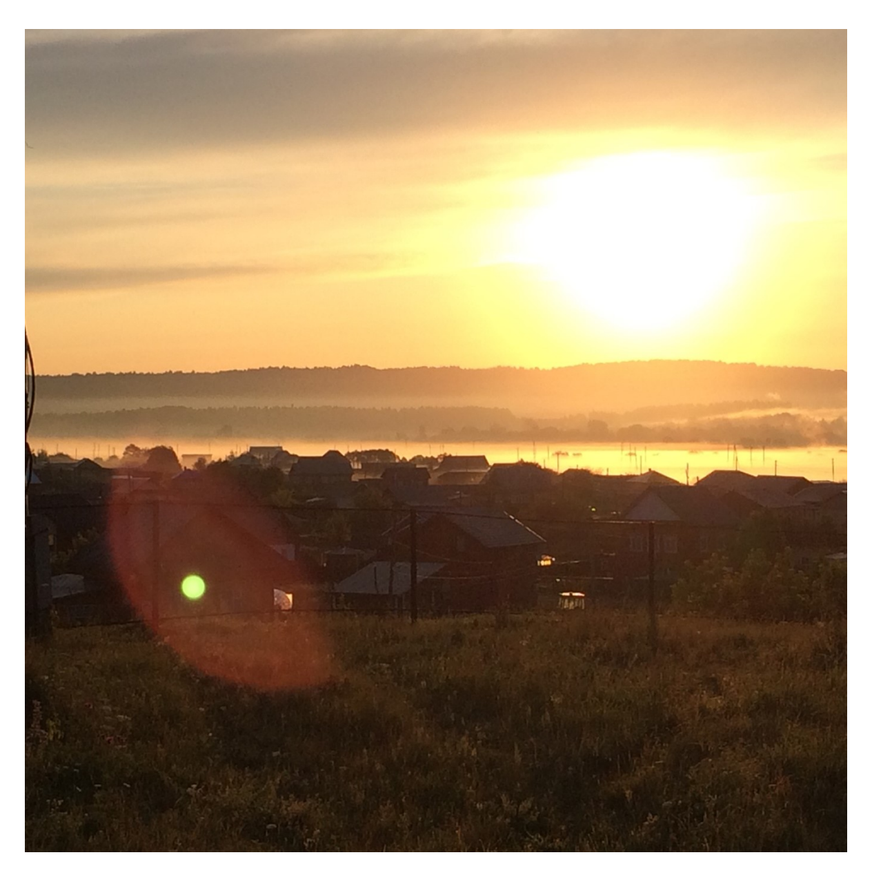
Figure 1 The valley of Barda in the early morning hours.

as the Muslim centre of Perm Krai, and Tatar cultural values help to configure social relations among family members, friends, acquaintances, and neighbours. It is important to mention, however, that not all Muslims share the same outlook in Russia, and those that I was in contact with are mostly of the vernacular kind. Other Muslims may not care so much about Tatar culture and history and tend to be less accepting of the Russian discourse about "traditional" religions.