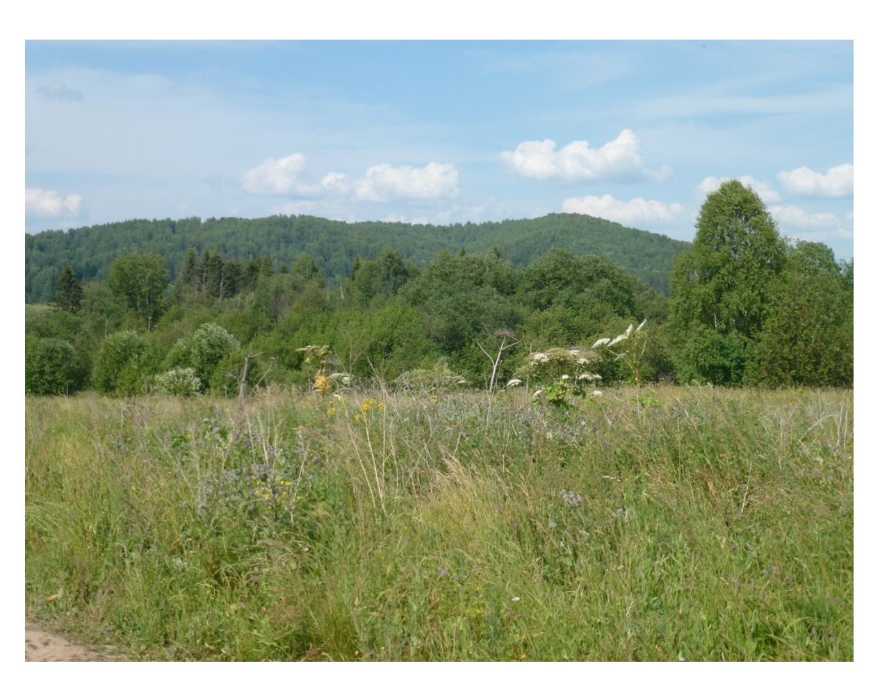
Figure 3 A view of Sultan-galib.